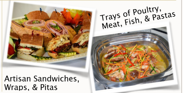
Trays of Poultry, Meat, Fish, & Pastas

Lunchtime is break-time. It's time to step away from your daily tasks and get much needed nourishment, sit and recharge to concur the remainder of your day. We offer an array of Hot & Cold options. From fresh Artisan Sandwiches to Pastas and sure to please family, friends, & coworkers. (10 person minimum)