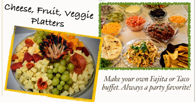
Cheese, Fruit, veggie Platters

Make an impression while making your presentation by delivering appetizing meals or snacks. We can offer Hot & Cold Buffets, Fruit or Veggie platters, Sandwich trays & fresh home-made desserts by our in-house bakery. Tell us how we can fulfill your catering needs. (10 person minimum)