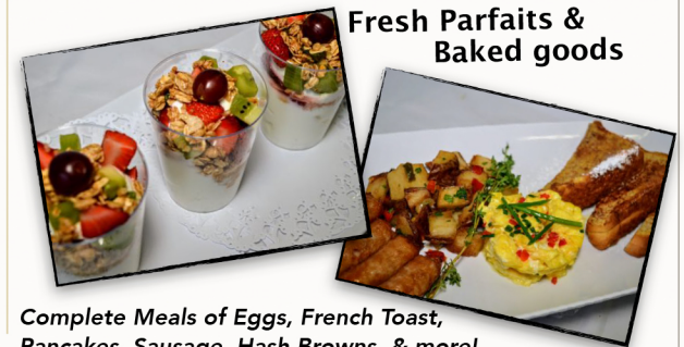
Fresh Parfaits & Baked goods

Breakfast is the most important meal of the day. That begins with not just a snack, but a solid healthy meal or fresh continental breakfast of home-made quality options. For morning meetings to group outings, bring the team together to take on the day. (Breakfast must be a 20 person minimum order)